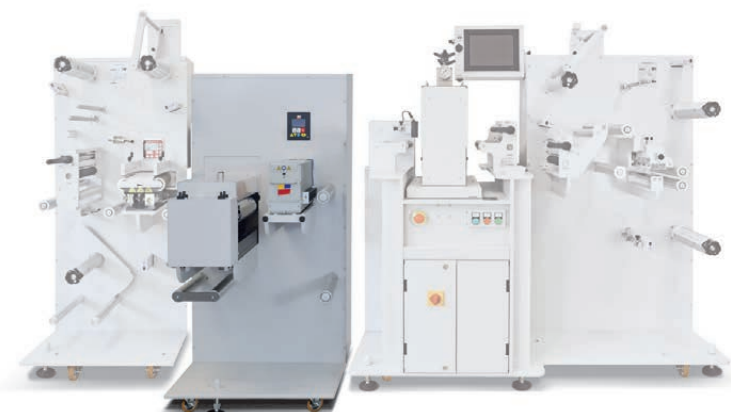
UV Varnish module inline with Aries