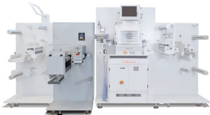
UV Varnish module inline with Taurus

Easy to use, it allows an alternative media protection to the classic cold lamination to offer a superior finishing level.